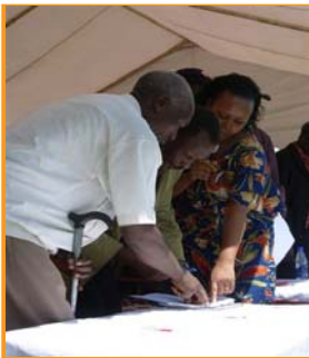
Local leaders from Sotik and Borabu signed the community social contract