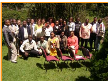
Participants from ACORD Area Programme representation in Africa.

After the second year of implementation of the strategic plan (2007 - 2010), ACORD convened a one-week annual retreat to take stock of progress made and revise activities and targets for 2009, building on the review process of 2007 and 2008. The event was held at Thayu Roundvales in Tigon, Kenya from 1st to 5th of December 2008 and assembled programme managers from a total of ten Area Programmes: Rwanda, Burundi, Sahel I (Mali, Burkina Faso Guinea & Mauritania), Sahel II (Chad and Cameroon), Mozambique, Uganda, North and South Sudan, Tanzania and Ethiopia as well as a majority staff at the secretariat.