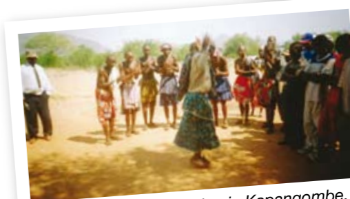
Open community meeting in Kapangombe, Namibe province