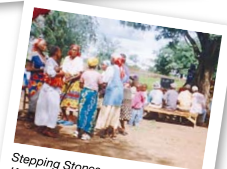
Stepping Stones session in Kanjanguite, Angola