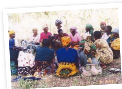
Mwanza Stepping Stones session

The establishment of an Advisory Committee bringing together project partners, service providers, policy makers and community representatives encouraged strong collaboration between SS project and partners in complementing social services and has led to some concrete improvements in the services provided. However, while poverty persists, HIV/AIDS vulnerability will remain acute.