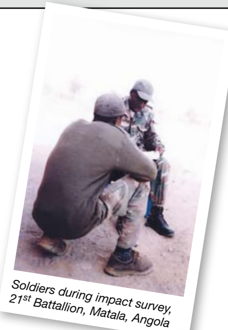
Soldiers during impact survey, 21st Battalion, Matala, Angola