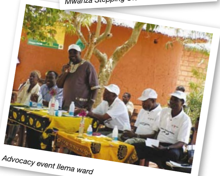
Advocacy event Ilema ward