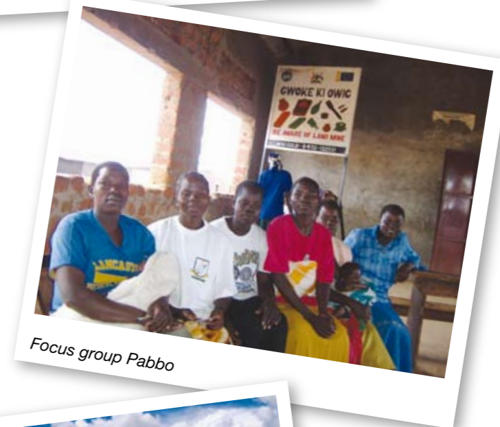
Focus group Pabbo