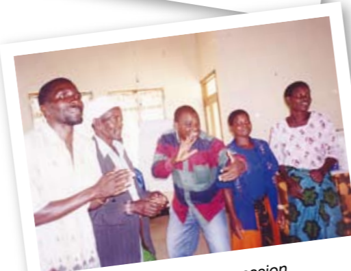
Mwanza Stepping Stones session